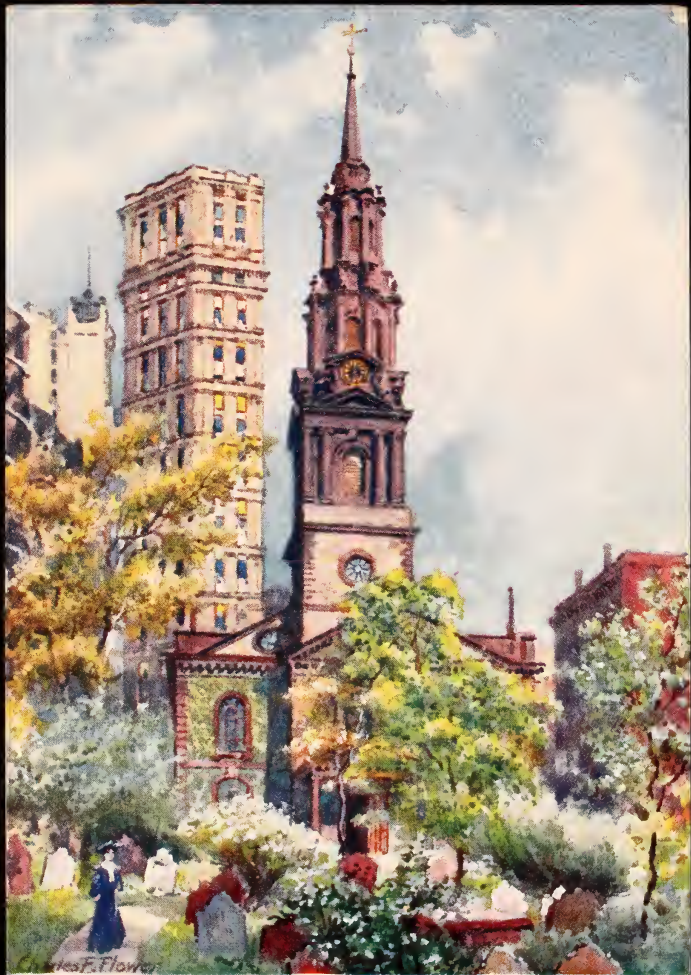
ST. PAUL'S CHURCH. Built 1764 to 1766.